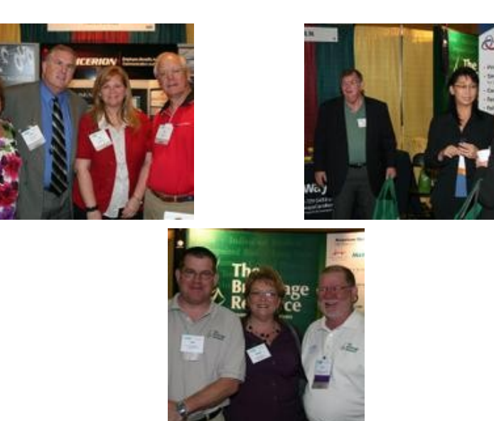
Just a few of the vendors...

NAHU welcomes the Winston-Salem State University March Band! This is a real treat every year! They sure do liven the place up!