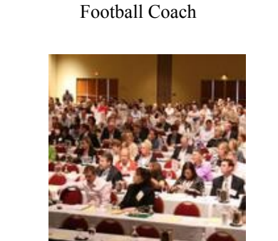
2010 NAHU Symposium Attendees